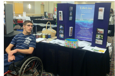
PJ is going to college while doing a volunteer internship with a local